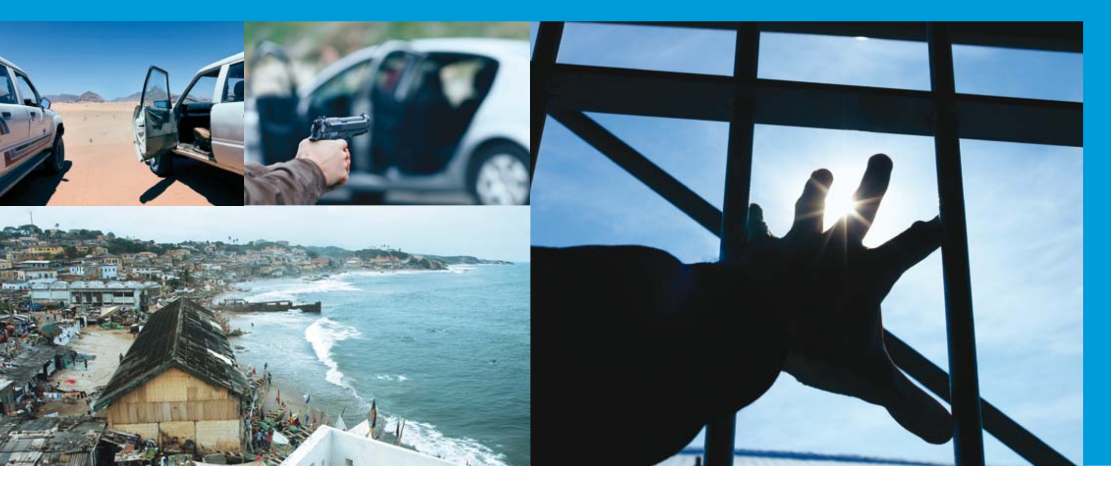
Kidnap & Ransom, Piracy, Extortion and Threat Sales Playbook